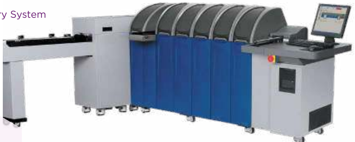
MXD210 Card Delivery System

Print-on-demand: Leverage black and white printing inline, feeding pre-printed sheets into the system.