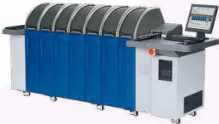
MX2100 Card Issuance System

Service and support: The MX Series Platform is supported by the industry's largest service and support network, which spans more than 150 countries worldwide. Online and phone support is available 24/7.